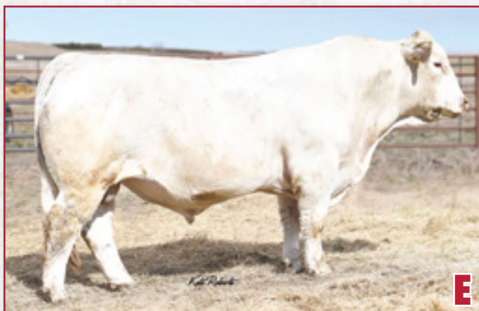
E LT RANSOM 8644 Polled Reg#: M914463