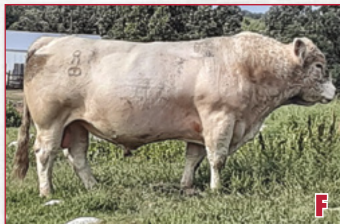
F LT JOURNEY 7657 PLD Polled Reg#: M897833